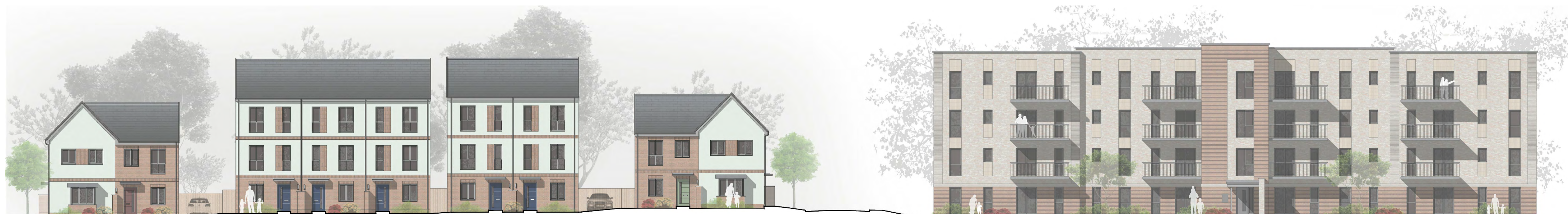
DATUM - 19.00 Street Scenes DD