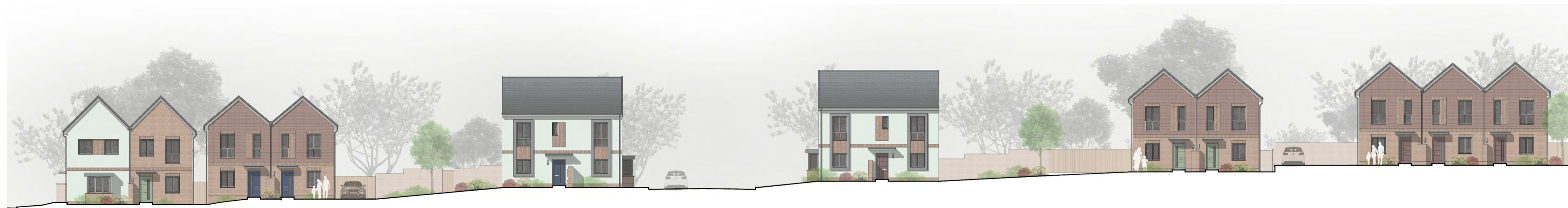
DATUM - 15.00 Street Scenes BB - Continuation