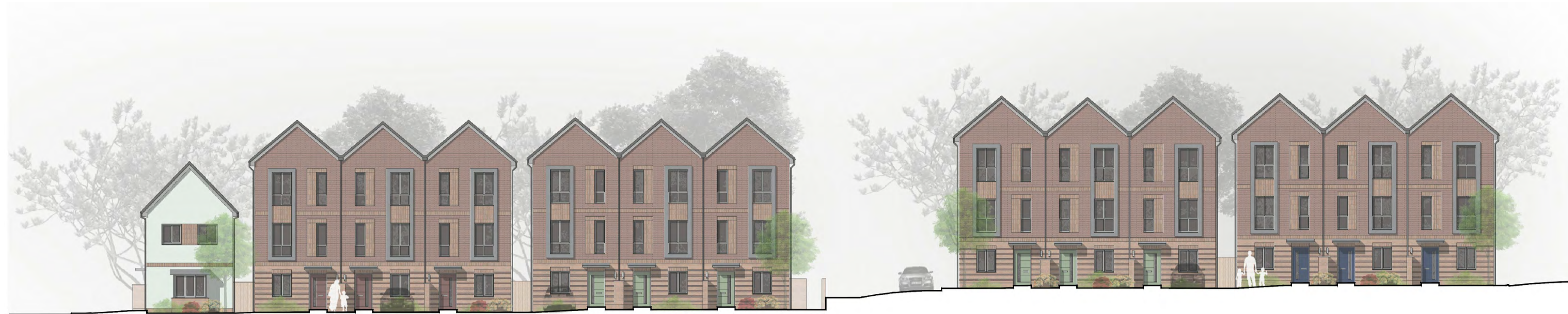
DATUM - 15.00 Street Scenes BB