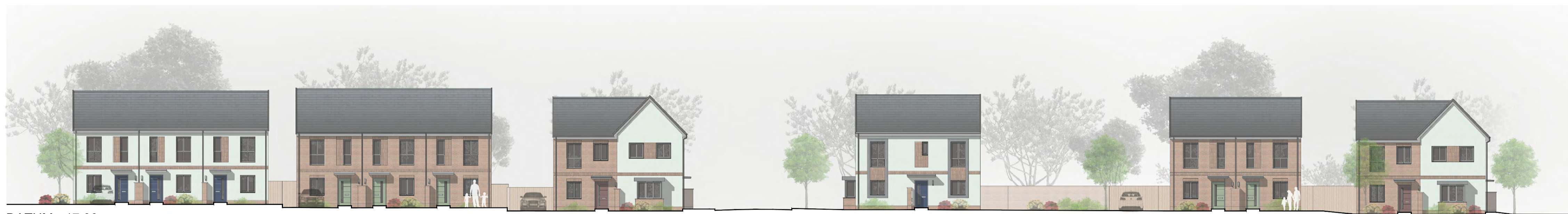
DATUM - 17.00 Street Scenes CC