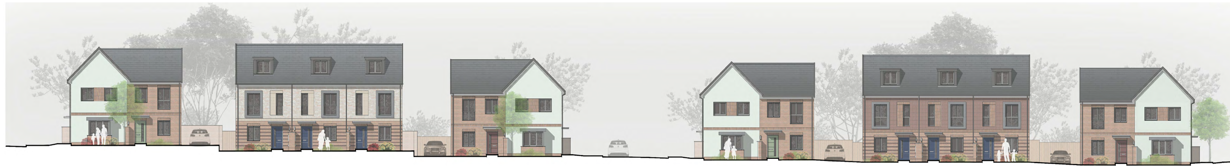
DATUM - 20.00 Street Scenes AA